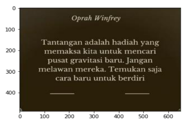
Fig 3. Image dataset to be extracted