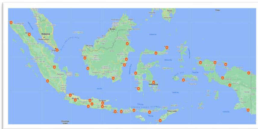
Fig. 2. Map of the distribution of airport locations that originate from the main flight routes

With this in mind, the researchers determine the main and feeder routes on the national aviation network. Figure 3 shows that the Main Route includes flights from 43 airports. According to PM 88 of 2013, 694 routes originate from the airports in Table 1, and 48%, or 330, of them are in the main route category. The remaining 364 routes fall under the feeder route category. This research limits the analysis to only flight origins from class II airports, so the flight origin nodes from 43 airports only remain at 36 airports for 290 main routes. Figure 2 displays the distribution map of airport locations originating from the main flight routes under analysis, while Figure 3 displays the flight network map based on the list of airports.