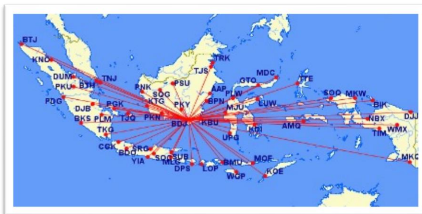
Fig. 4. Scenario 1 is one of the five proposed aviation network map scenarios. The scenario of Banjarmasin (Hub) encompasses 48 airports in Indonesia (Spoke).

Based on the list in Minister of Transportation Regulation 88 of 2013, the researchers create a matrix containing the main airports and limited the analysis to a minimum of class 2 airports. The matrix's size was 49 x 49 grid (49 airport matrix).