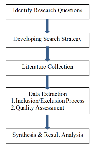
Fig. 2. The Steps of The Study

The next stage is to establish the SLR's search methodology. The first step was to settle on a database of choice. The authors have opted to utilize several different databases, some of which include the ACM Digital Library, IEEE Xplore, and Springer. The author then searched from January 2019 through December 2022 using the keywords "elements of" AND "lifelogging or augmented reality or virtual reality or digital twin or mirror world" in the selected databases. At this point, the authors started searching for the selected keywords in the selected databases to collect the relevant literature.