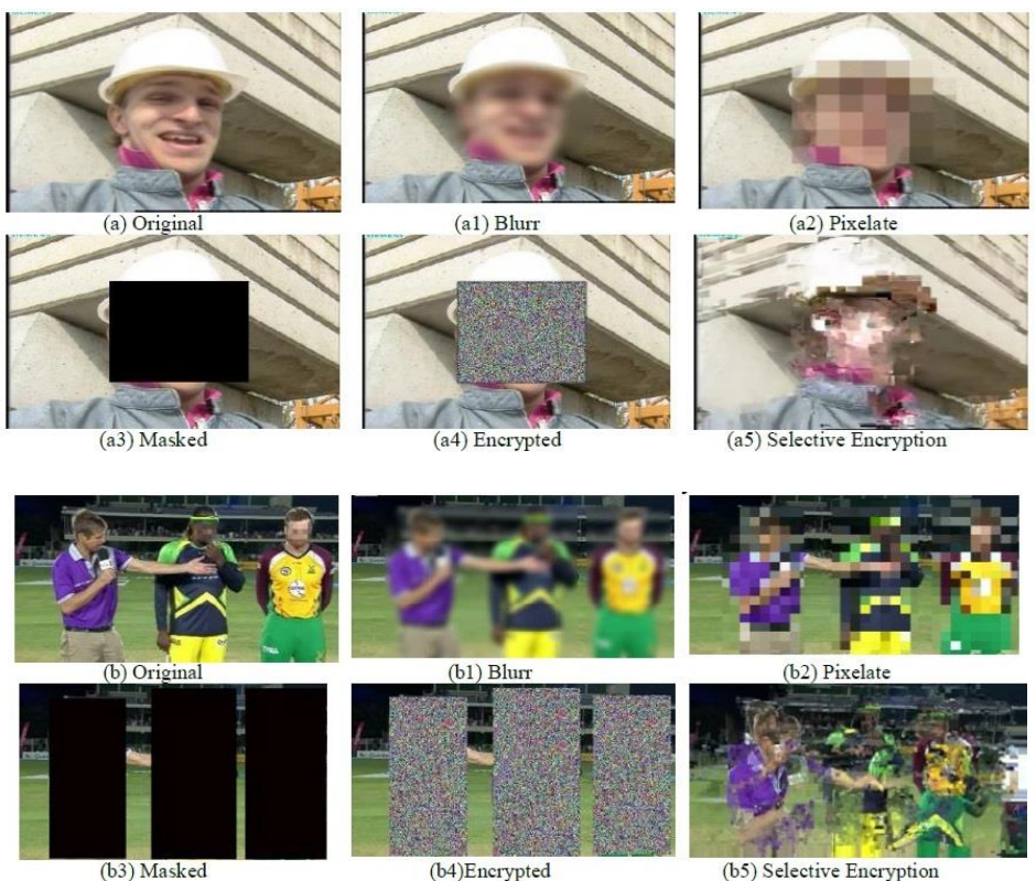
Fig. 1. Images that illustrate privacy(Shifa et al., n.d.).